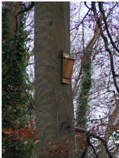
World Land Trust: Tree Creeper box installed at Kites Hill