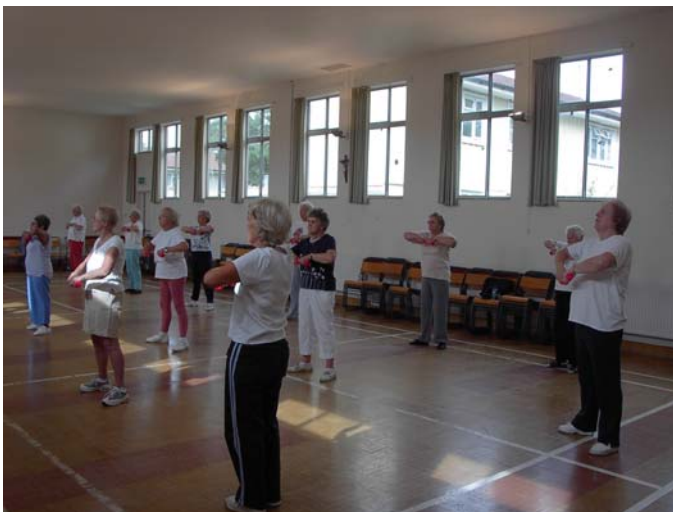
Whaddon, Lynworth & Priors Neighbourhood Project: Older & Bolder project 2005.