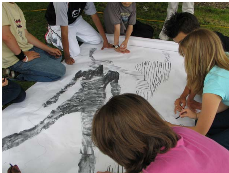
Quenington Sculpture Trust: 'Fresh Air 2005' project.