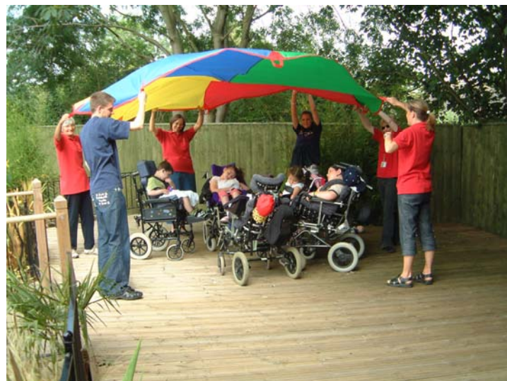
James Hopkins Trust: £5,000 grant to support the provision of care.