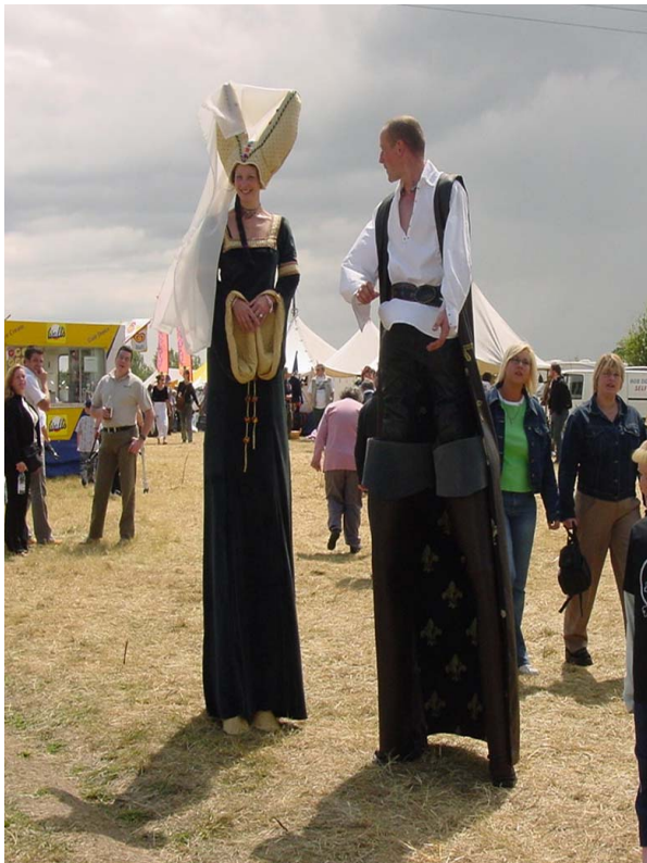
Tewkesbury Medieval Festival 2005: Entertainers 'FethZana' stiltwalkers.