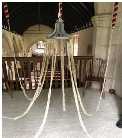
Bell Rope Holder by Cotswold Friends