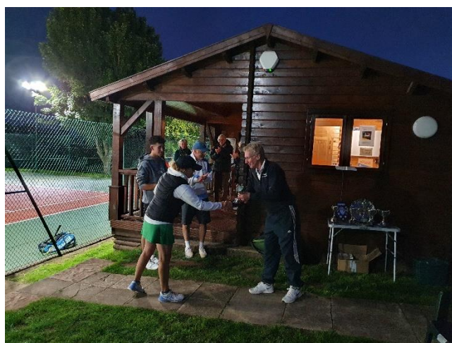
Redmarley Tennis – Mixed Doubles under Floodlights