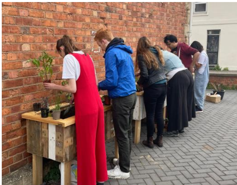
Vision 21 – Plant Cheltenham Hubspace Appeal