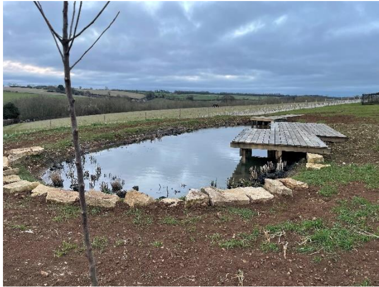
Landscaping at Scrubditch Care Farm