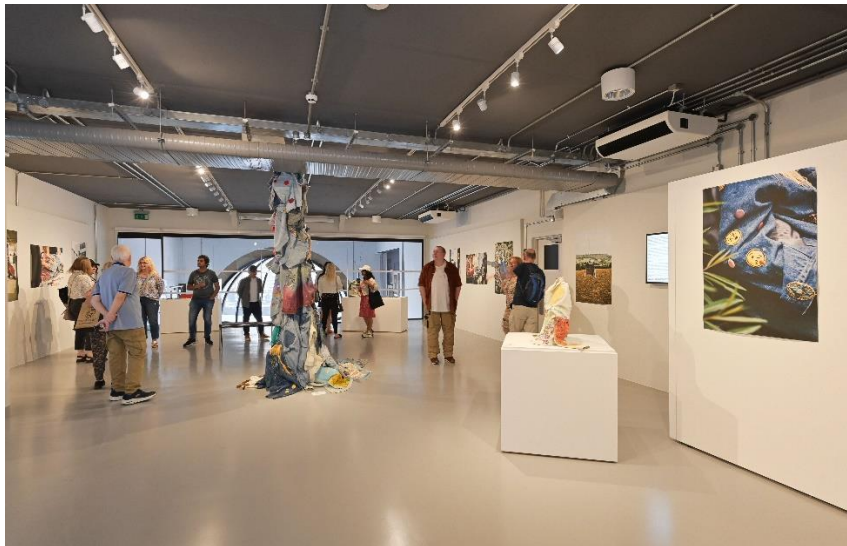
The Wilson, Cheltenham