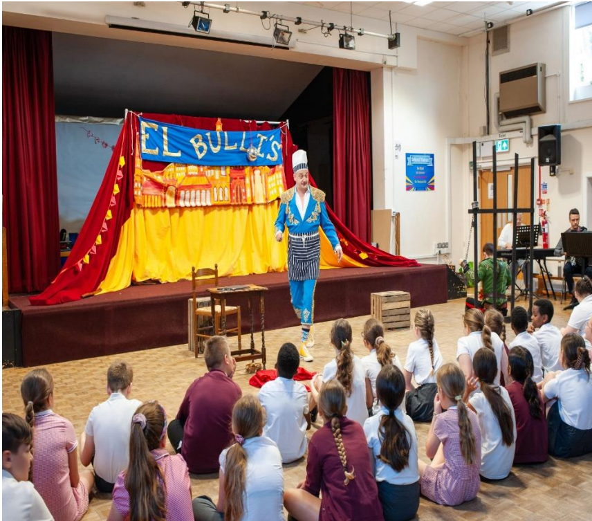
Above Picture: Playground Opera 2023, Longborough Festival Opera