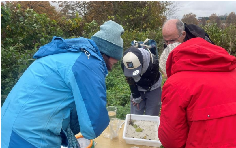
Above Picture: Wild Stroud