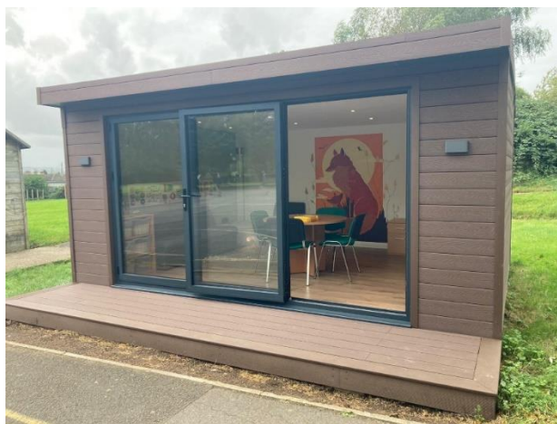
Below Picture: The Cabin, Friends of Foxmoor