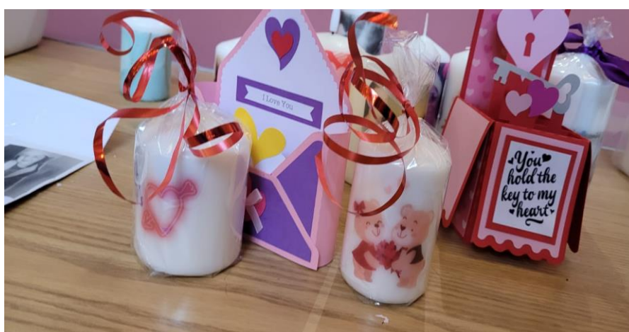
Above Picture: GL4 CIC, Craft Classes